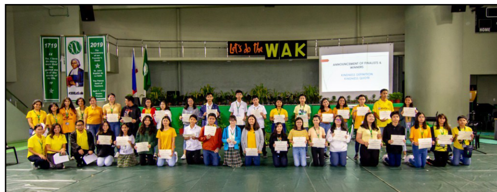
Kindness Project for the Agency-Hired employees

the janitors and the teachers treated the janitors with snacks.