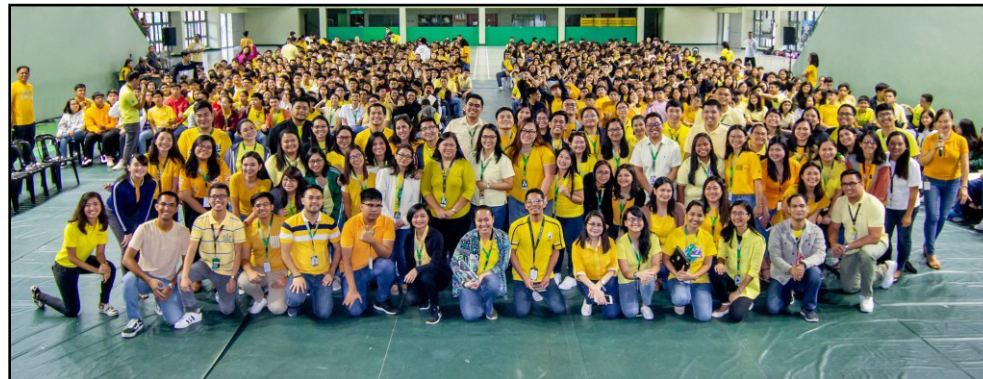
JHS teachers with Grades 9-10 students

Moreover, prior to the launch, a number of Grade 10 Faculty and students similarly initiated a WAK activity where students cleaned up their classrooms for a day, thus giving a little rest time to