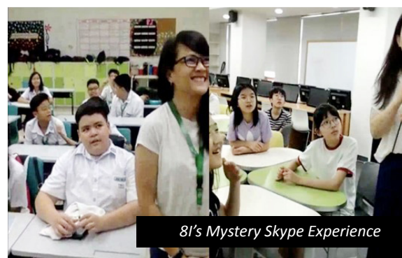
8I's Mystery Skype Experience

the first ever Mystery Skype activity participated in by all Grade 8 students in the Alabang campus. Mystery Skype is an educational game connecting two classrooms from different parts of the globe. The learning targets of our activity included locating another classroom from other countries using Yes/No questions and formulating questions based on