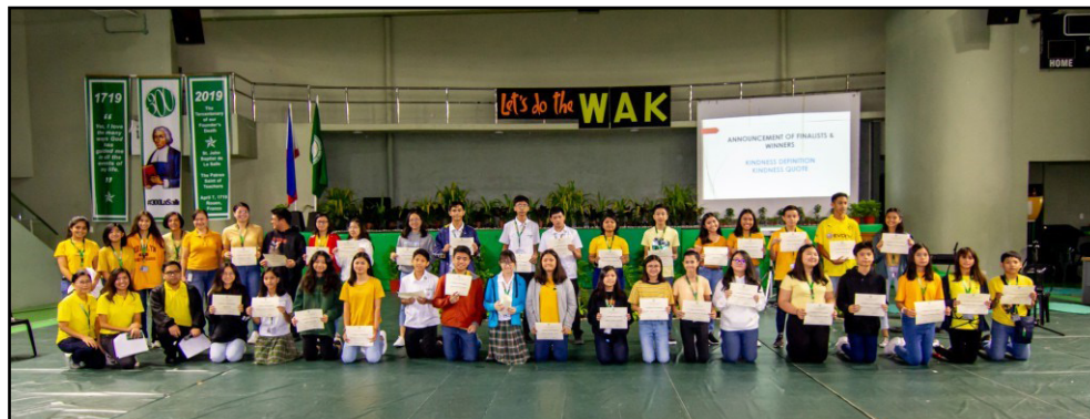
36 finalists at the Kindness Definition Contest