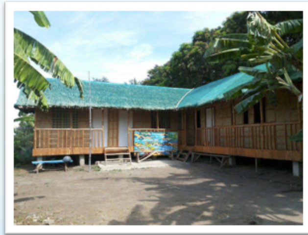
Accommodations at Calataganda Travel and Tour Services

We have two kinds of accommodations, depending on the dates you confirm. One is a family-owned home in Buluarte Estates, Calatagan. There are two spacious bedrooms, one for males and one for females, and two bathrooms. The other one is the accommodations of Calataganda Travel & Tour Services, walking distance from the beach. There are several rooms with a bathroom per room.