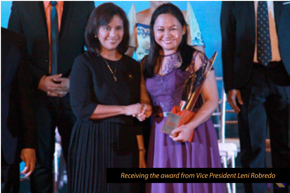
Receiving the award from Vice President Leni Robredo