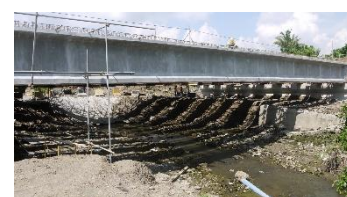
DLSZ Vermosa Bridge as of July 28, 2016