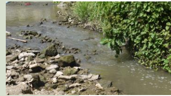
The creek adjacent to DLSZ Vermosa Campus