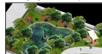
Hardin ng Kaginhawahan Project: