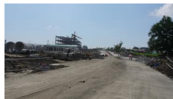
De La Salle Avenue as of July 19, 2016