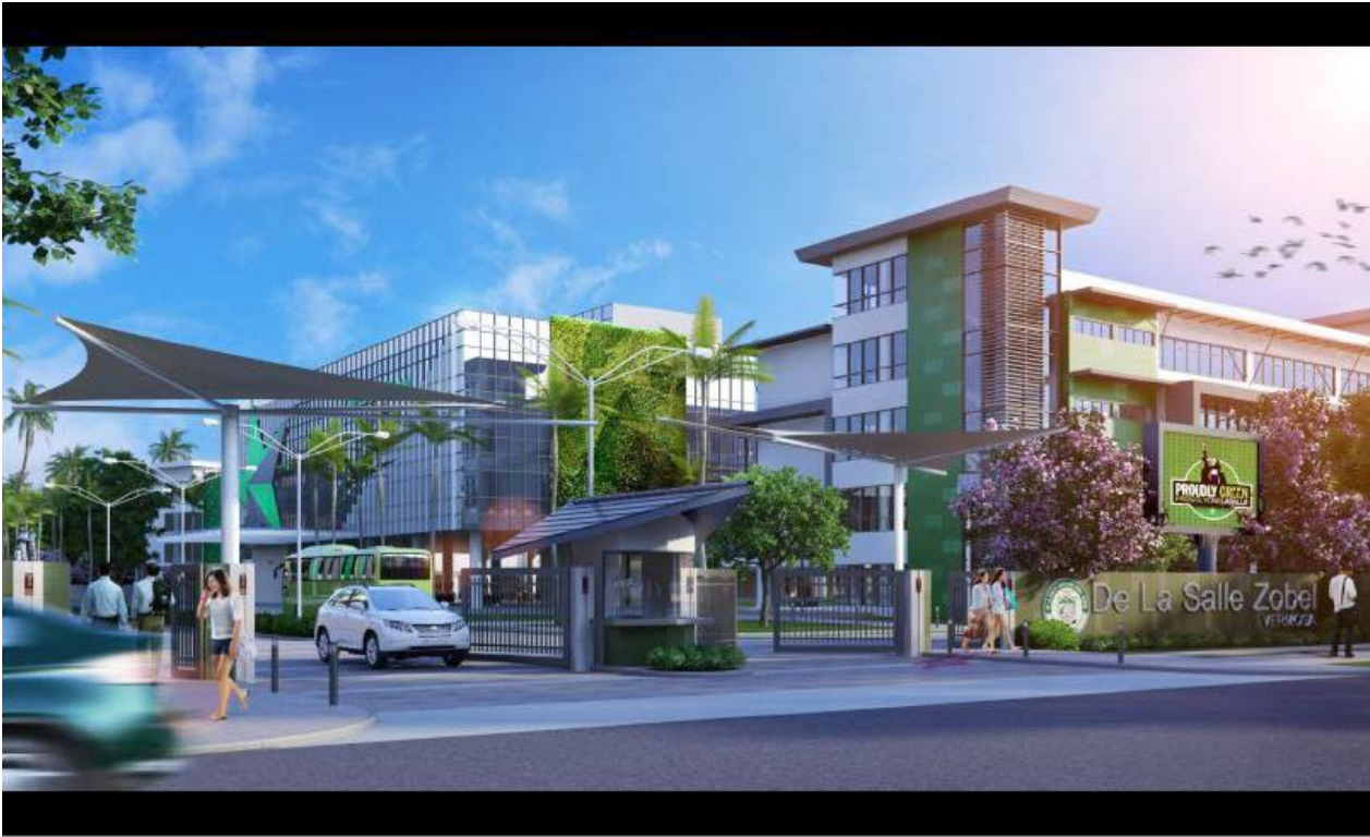
FRONT ENTRANCE PERSPECTIVE