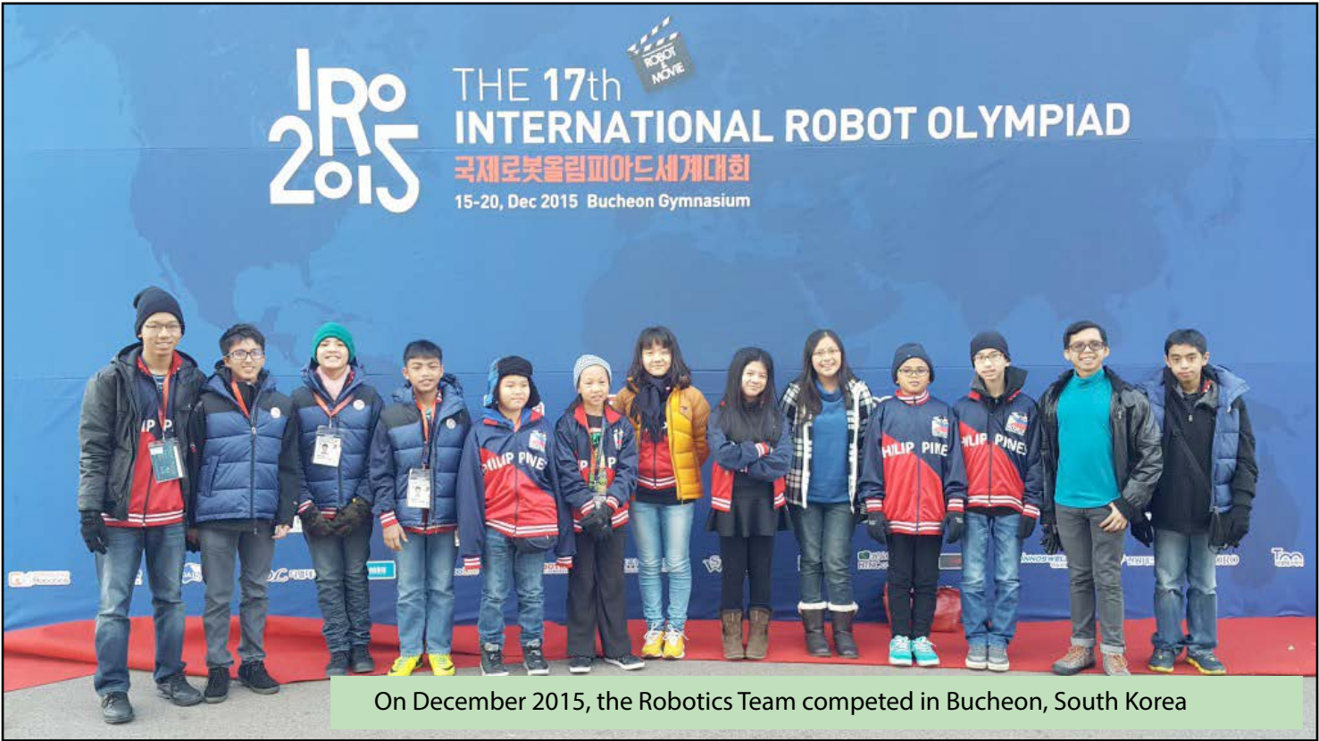
On December 2015, the Robotics Team competed in Bucheon, South Korea