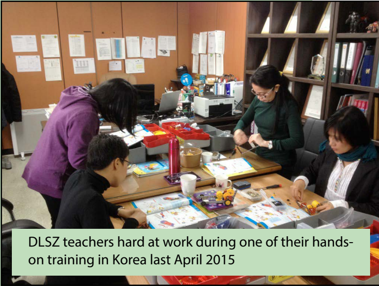
DLSZ teachers hard at work during one of their hands-on training in Korea last April 2015