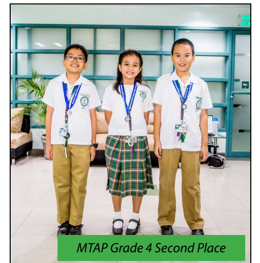
MTAP Grade 4 Second Place