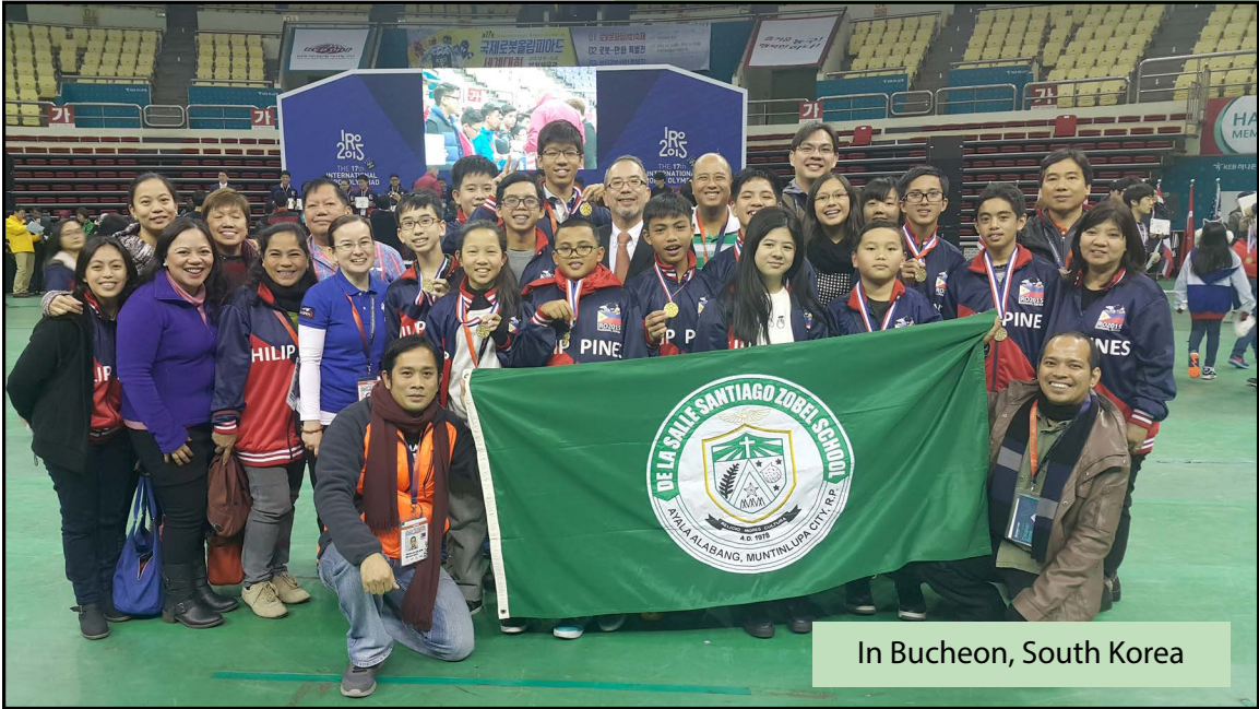
In Bucheon, South Korea