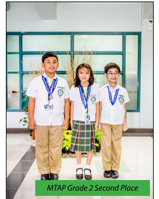
MTAP Grade 2 Second Place