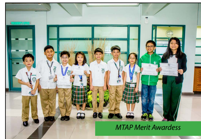
MTAP Merit Awardess