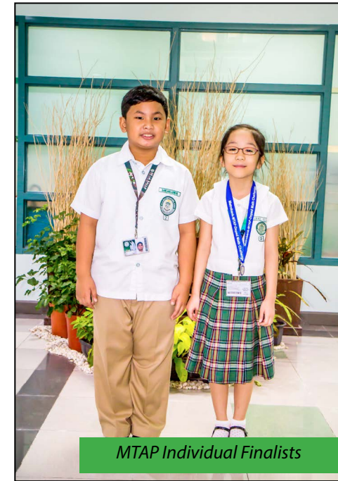
MTAP Individual Finalists