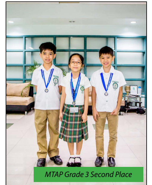
MTAP Grade 3 Second Place