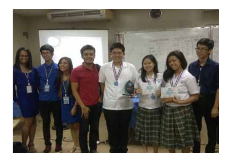
UP DILIMAN IMPACT 2015 – 1<sup>ST</sup> PLACER (CHAMPION)